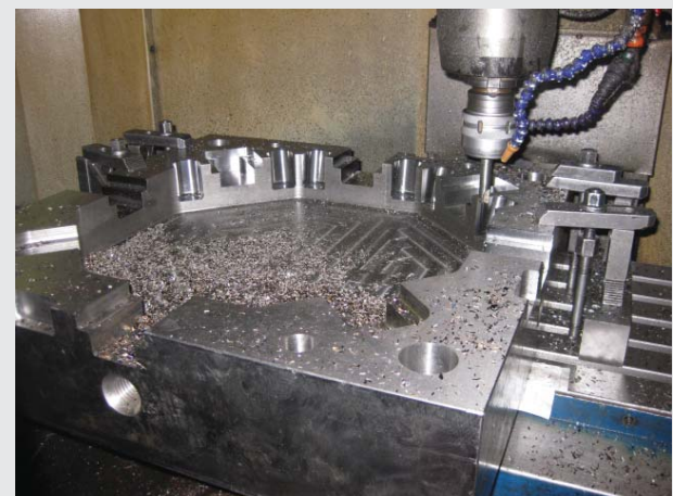
A mold for a plastic injection part being produced.

The process is more precise than manual machining, and can be repeated in exactly the same manner over and over again. Because of the precision possible with CNC Machining, this process can produce complex shapes that would be almost impossible to achieve with manual machining. Various metals and plastics can be machined to exact specifications.